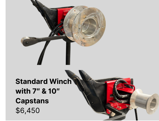
Standard Winch with 7" & 10" Capstans $6,450