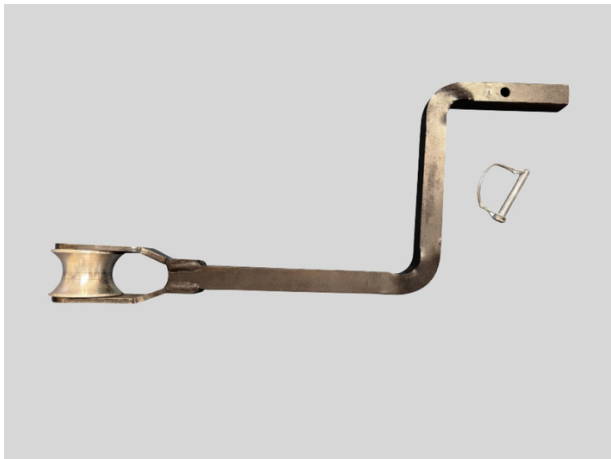
Extension Arm $400

(The extension arm easily slides into the winch bracket, giving you extra reach when space is tight or access is limited.