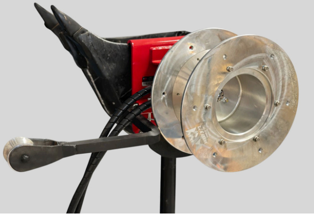
10" High-Capacity Cable Puller $5,750