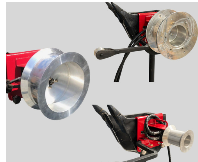
Standard Winch with 7", 10" & 15" Capstans $7,000

Slide it into the winch bracket, position the winch closer, and tackle pulls from meter boxes, vaults, or other confined areas with confidence. No more awkward angles or struggling to get the right line.