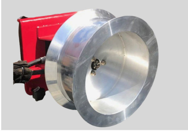
15" Small Fiber Pulling Capstan $5,900.00